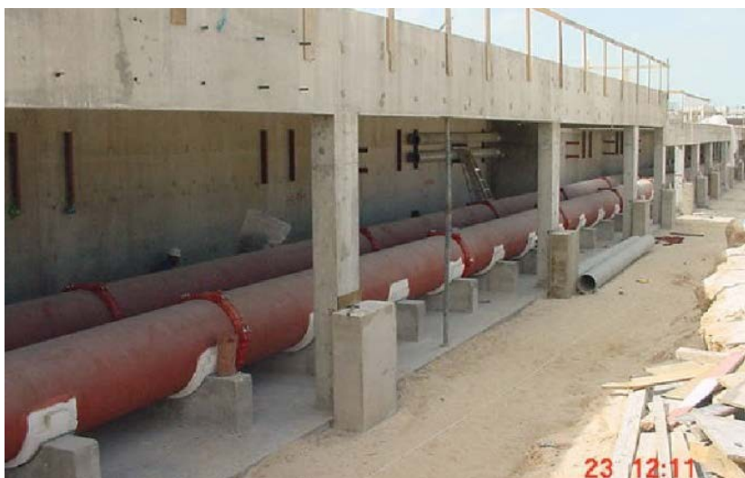
The 30" HVAC-line distributing chilled water to various phases at Medinat Jumeira using Shurjoint Fittings

Shurjoint was specified for the District Cooling and HVAC system. The grooved system has a unique ability to accommodate tight spaces as pipes were Grooved at the Trouvay Cauvin Jebel Ali yard by experienced technicians using automated precision roll-grooving machines capable of roll – grooving sizes up to 34 " instead of at the job site, and grooved design permits the flexibility to accommodate expansion or contraction of pipe-line under extreme weather conditions.