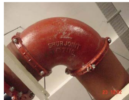
24" Elbow 90 Degree Shurjoint Model 7110 and 24" Coupling Model 7707 in Painted.