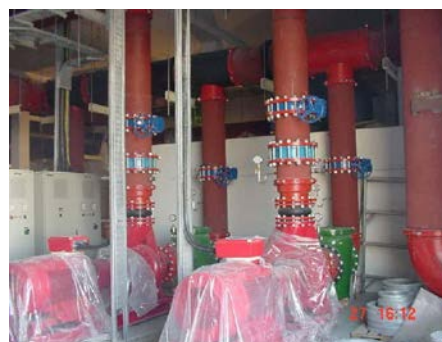
Details of HVAC components in the utility room connected with Shurjoint Elbows.