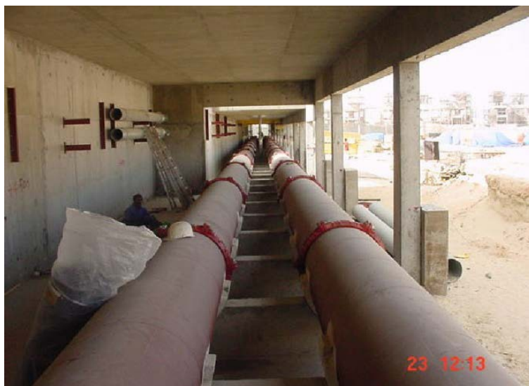
The 30" HVAC-line from utility room to the port entry of the hotel.