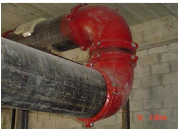
Granada Center- 24" Elbow 90 Degree Model 7110