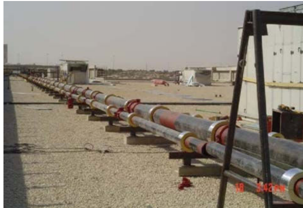
24" Chilled Water Lines