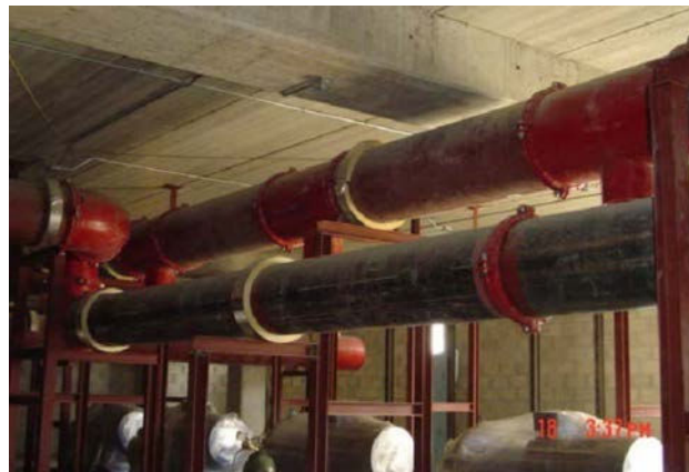
24" Dia Chilled Water Lines- inside Pump Room