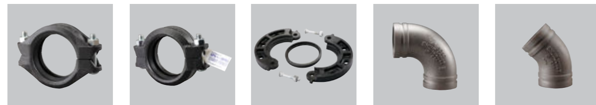
#A505 AWWA Coupling 3" ~ 12" #A507 Transition Coupling 3" ~ 12" #A512 Flange Adapter 3" ~ 12" #A10 90° Elbow 3" ~ 12" #A11 45° Elbow 3" ~ 12"