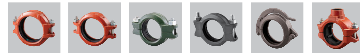
#Z05 Angle Pad Rigid Cplg. 1¼" ~ 8" #Z07 / #Z07N Heavy Duty Angle Pad Rigid Cplg. 1¼" ~ 12" / 14" ~ 24" #XH-1000 Extra Heavy Rigid Cplg. 2" ~ 12" #XH-70EP Extra Heavy End Protection Rigid Cplg. 2" ~ 12" #G-28 Hinged Lever Coupling 1½" ~ 10" #C-7 Outlet Coupling 1½" x ½" ~ 6" x 2½"