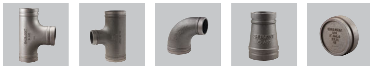
#A20 Tee 3" ~ 12" #A25 Reducing Tee 4" x 3" ~ 12" x 10" #A10R Reducing Elbow 4" x 3" ~ 12" x 10" #A50 Concentric Reducer 4" x 3" ~ 12" x 10" #A60 Cap 3" ~ 12"