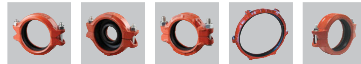
#7705 Flexible Coupling 1" ~ 12" #7706 Reducing Coupling 1½" x 1¼" ~ 8" x 6" #7707 / #7707N Heavy Duty Flex. Cplg. ¾" ~ 12" / 14" ~ 26" #7707L Large Dia. Coupling 14" ~ 42" #R20 Butt-Joint Rigid Coupling 1¼" ~ 12"