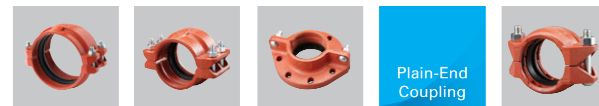
#H305 (IPS/ISO) HDP Coupling 2" ~ 20" (50mm ~ 450mm) #H307 (IPS/ISO) HDP Transition Cplg. 2" ~ 12" (63mm ~ 315mm) #H312 (IPS/ISO) HDP Flange 3" ~ 12" (63mm ~ 315mm) #79 For IPS Steel Pipe WILDCAT Coupling 1" ~ 16"