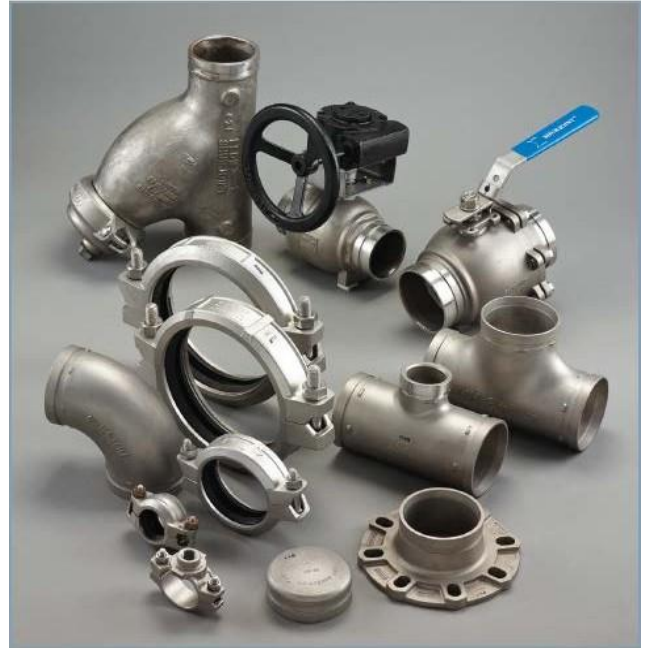
Groove corners are not defined

Stainless steel pipe in general is more difficult to groove than carbon steel pipe, as it is more difficult to achieve defined groove corners on stainless pipe. Grooves that are not defined and have too much of a radius could result in joint failure. Care must be taken to process grooves as defined as possible. For this reason, roll-groove machine manufacturers offer a variety of roll sets depending on the pipe material and wall thickness being grooved. Always select the correct roll set for the pipe being grooved.