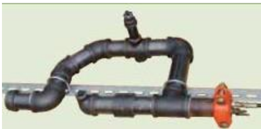
Burst pressure testing of DI threaded fittings (2")

Ductile Iron Class 300 threaded fittings are designed to the same basic dimensions as that of Class 150 malleable iron fittings. Though due to the superior strength characteristics, ductile iron fittings carry a much higher pressure rating. Laboratory tests confirm Shurjoint ductile iron fittings have passed hydrostatic test pressures exceeding 6,000 psi / 414 Bar, which is equal to four times the 1,500 psi / 103 Bar as specified by ANSI B16.3 for 1 1/2" – 2" sizes.